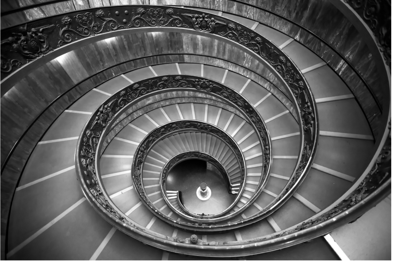
JURY CHOICE - 3 | PIDM | C 4 | THE_SPIRAL | GERALD FLEURY | USA