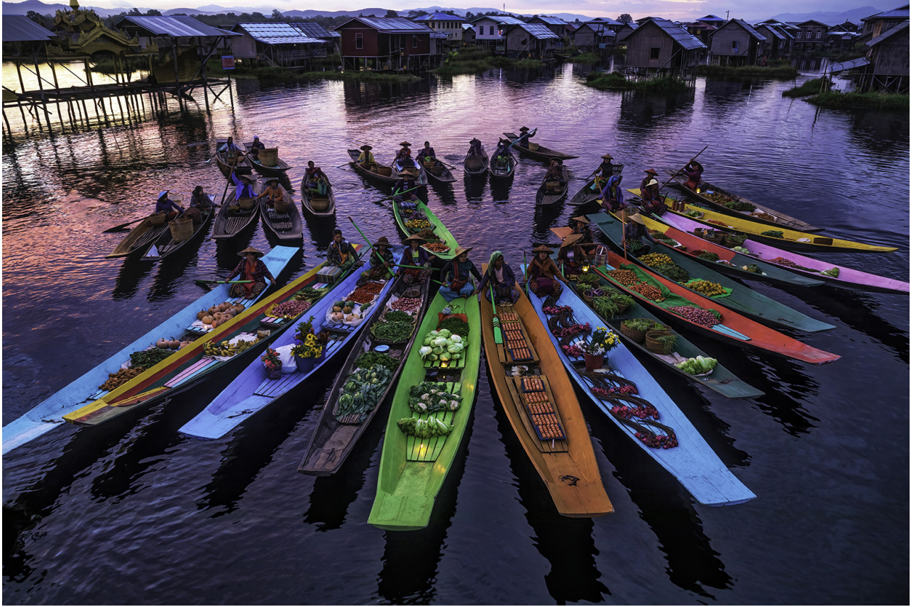
JURY CHOICE -3 | PIDC | C 4 | Inle morning bazar 4 | THAN SINT | Singapore