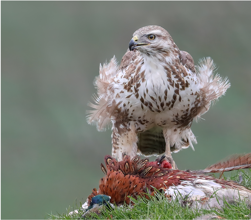
JURY CHOICE - 1 | ND | C 4 | Buzzard Feeding in the Wind | GILLIAN STEYN | England