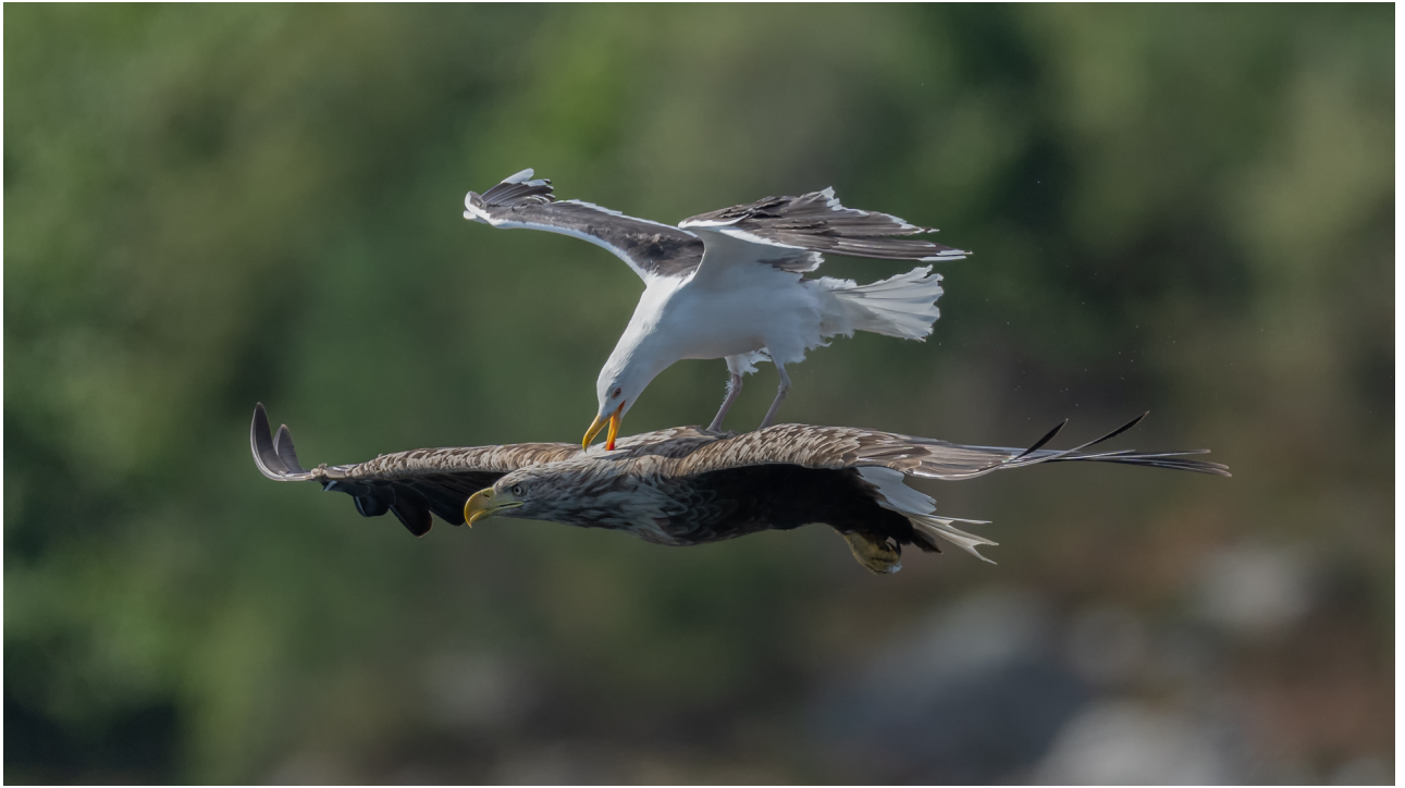
PSA GOLD | ND | C 2 | Eagle surfing | VEGARD HANSEN | Norway