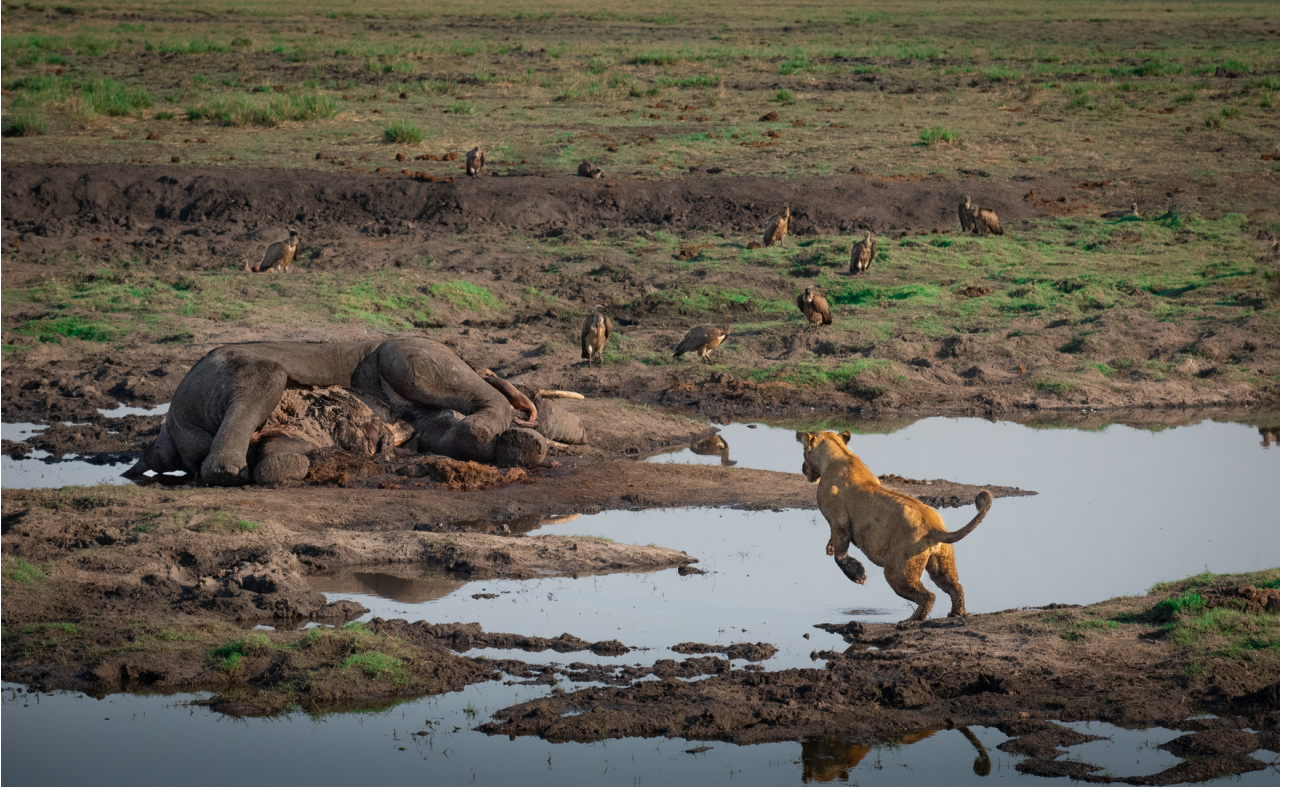
JURY CHOICE - 1 | PTD | C 2 | Lioness Race to her Kill | ANGELA POGGIONI | USA