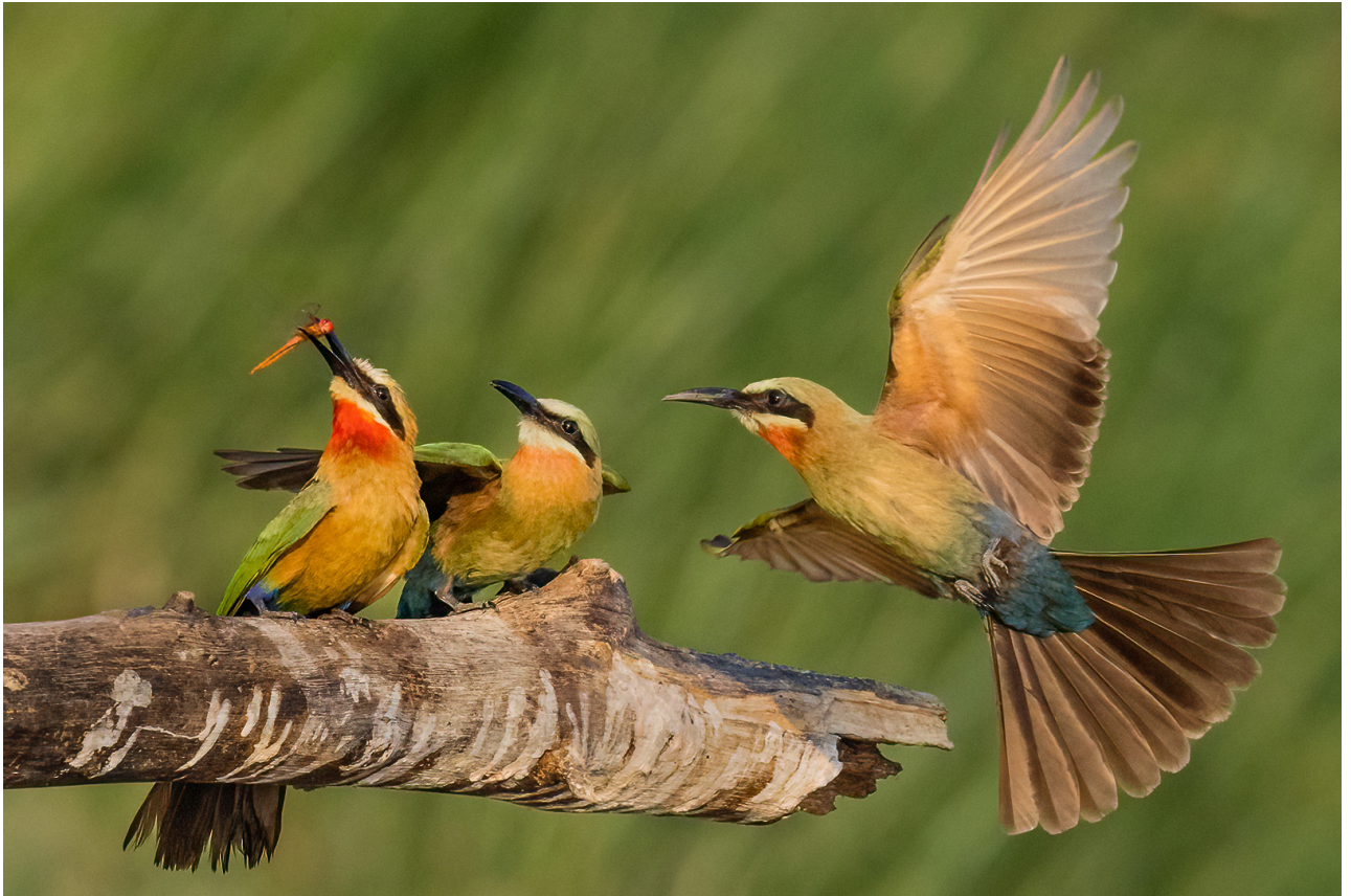
CERTIFICATE OF MERIT 2 | ND | C 4 | coming for a steal | JAN VILJOEN | South Africa