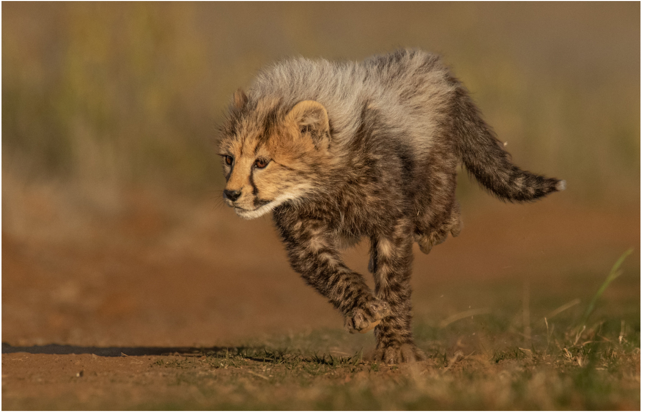
JURY CHOICE - 2 | ND | C 3 | wait for me me mom | JAN VILJOEN | South Africa