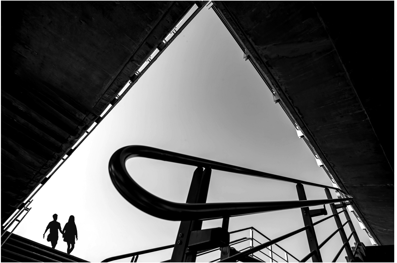
JURY CHOICE - 3 | PIDM | C 1 | Walking hand in hand | JEN CHIEH CHANG | Taiwan