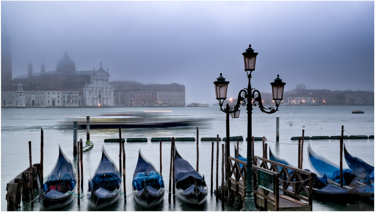
JURY CHOICE - 3 | PIDC | C 3 | Buongiorno Venecia 01 | BARBARA SCHMIDT | Germany