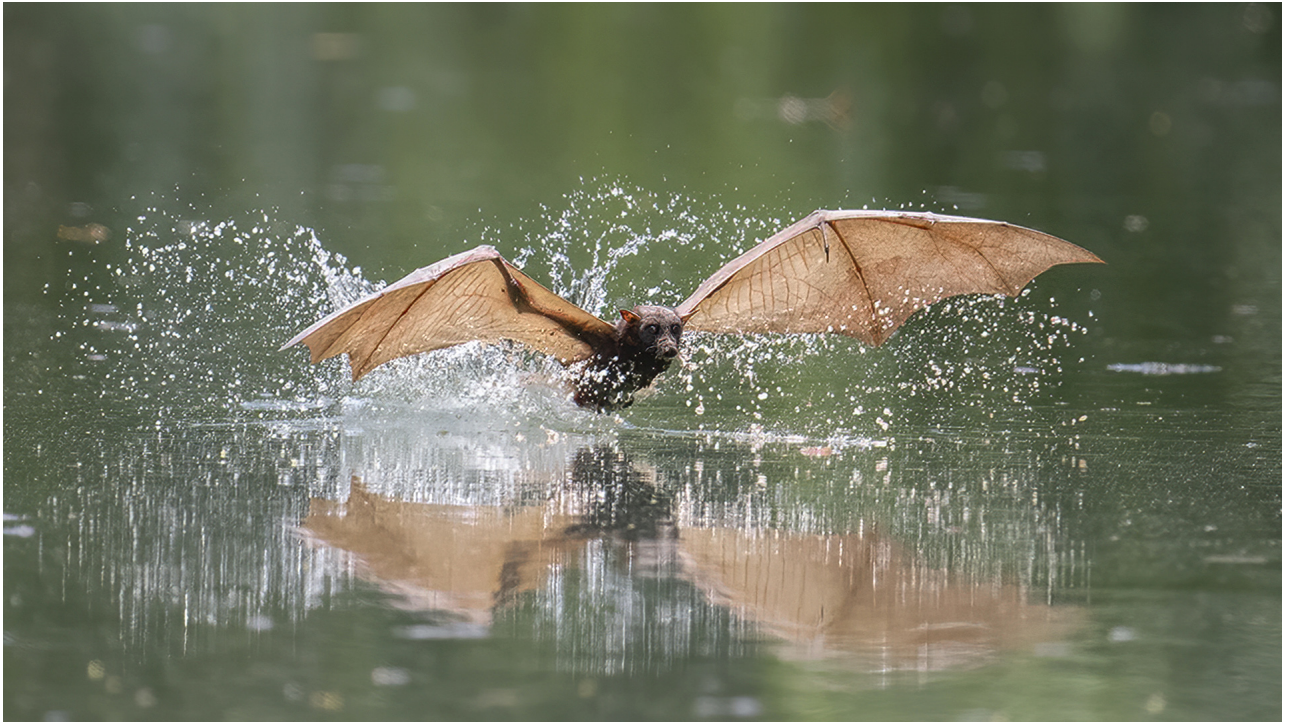
JURY CHOICE - 3 | ND | C 4 | Bat swooping down for a drink_00017 | HAI NGO | USA