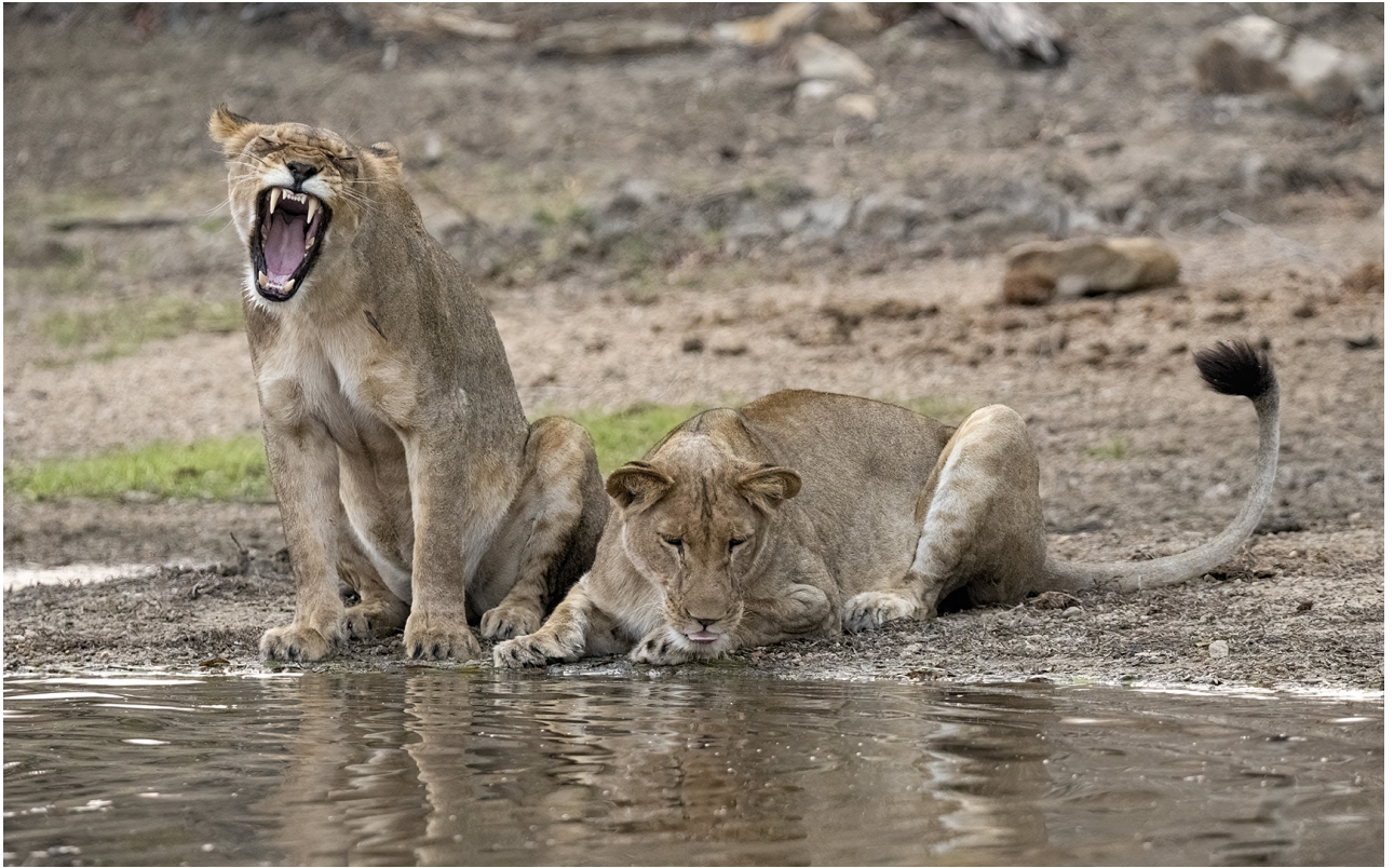
Honour Mention -1 | ND | C 2 | A Snarl and a Drink | LISA SCHNELZER | USA