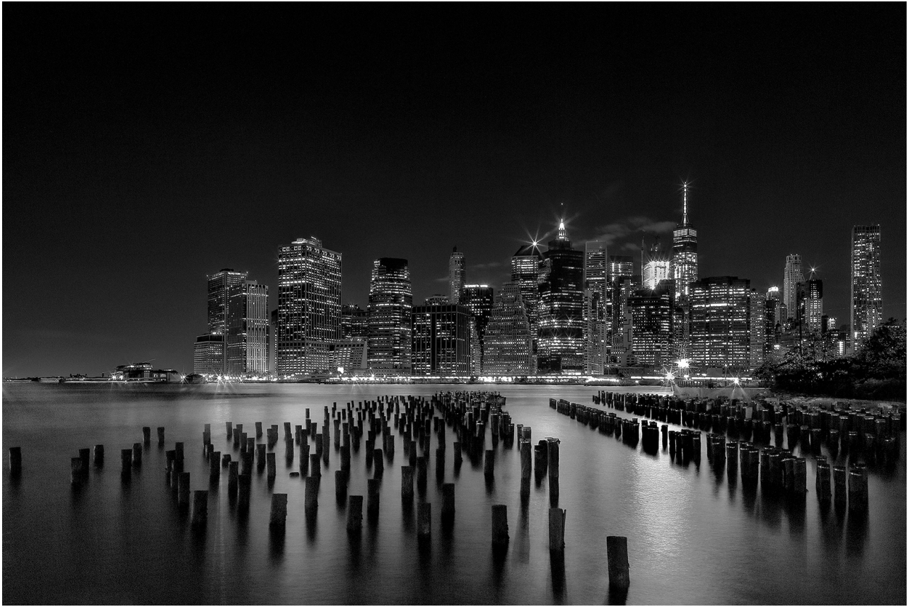
JURY CHOICE - 1 | PIDM | C 1 | Brooklyn Waterfront 3 bw | VOLKER MEINBERG | Germany