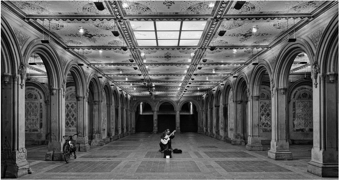
JURY CHOICE - 3 | PIDM | C 3 | Bethesda Arcade 17 | VOLKER MEINBERG | Germany