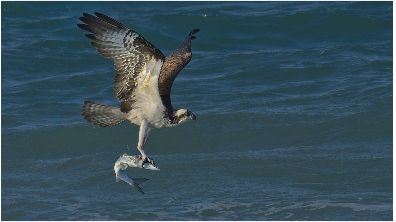
Honour Mention -3 | ND | C 2 | Osprey-foraging | FRANCOIS STPIERRE | Canada