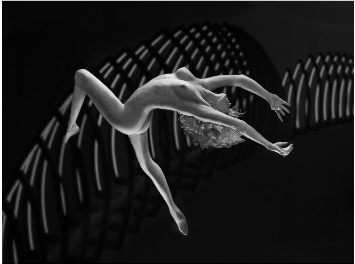
JURY CHOICE - 1 | PIDM | C 4 | Back Spin | SHIU GUN WONG | Hong Kong