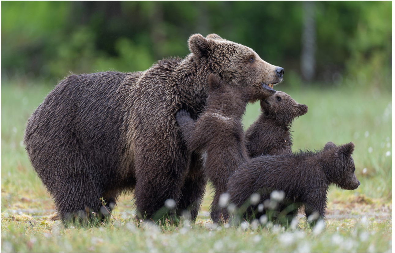
Honour Mention -2 | ND | C 3 | Can we go now mother | VEGARD HANSEN | Norway