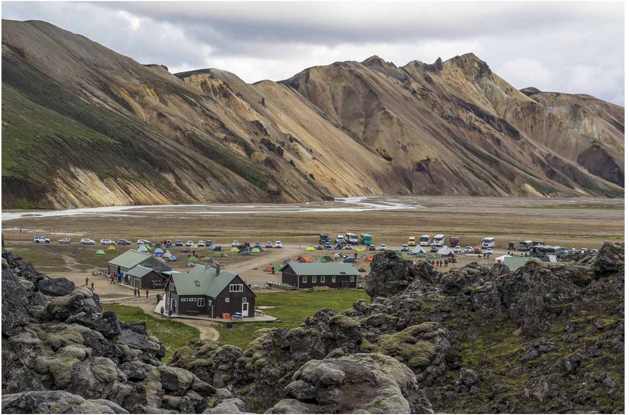
Honour Mention -2 | PTD | C 3 | Witch valley | VINCENZO DI PANFILO | Italy