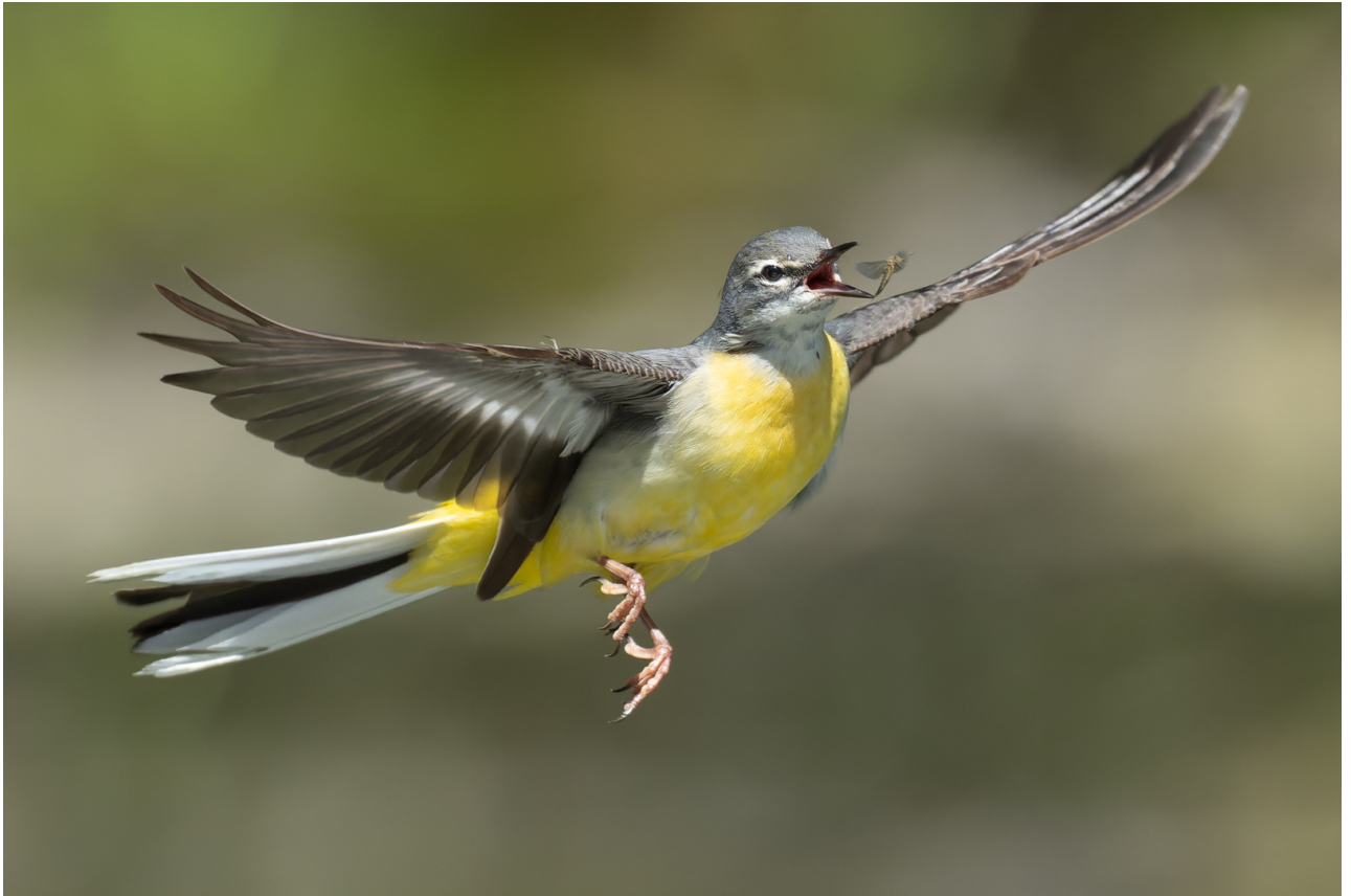
JURY CHOICE - 3 | ND | C 3 | Graceful catching | VEGARD HANSEN | Norway