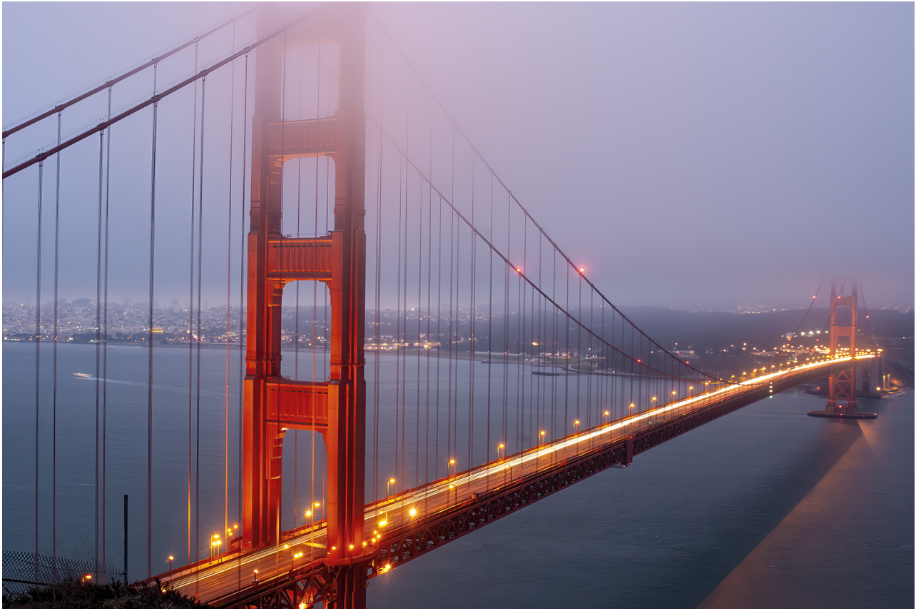
Honour Mention -1 | PTD | C 1 | Golden Gate Bridge in Fog | LISA SCHNELZER | USA