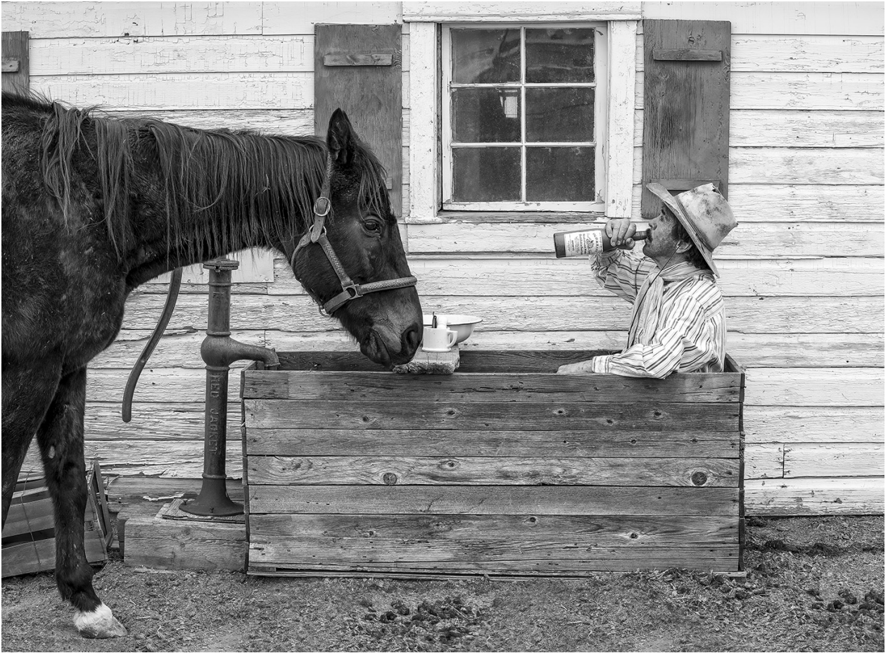
CERTIFICATE OF MERIT 2 | PIDM | C 3 | A Cowboy and His Horse | LISA SCHNELZER | USA