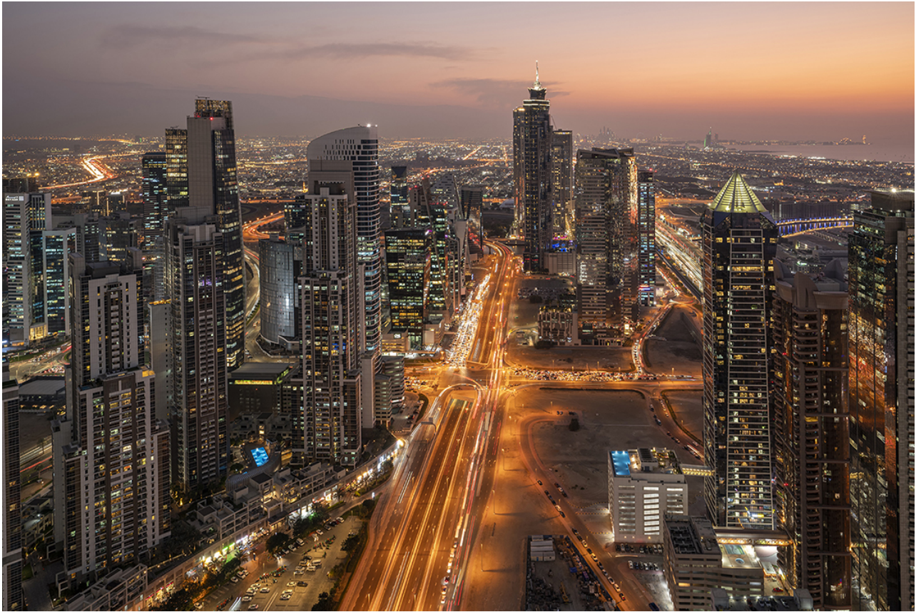
Honour Mention -2 | PTD | C 4 | Dubai Downtown1 | AJAR SETIADI | Indonesia