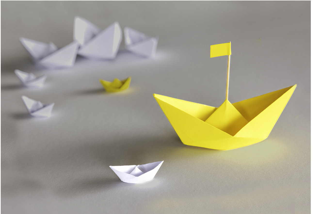
JURY CHOICE - 2 | PIDC | C 1 | Anventura - At The Port | LYDIA HOREMANS | Belgium