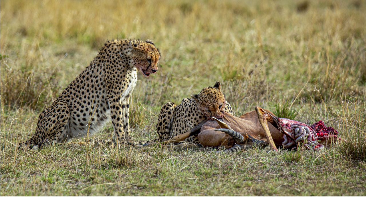
Honour Mention -3 | ND | C 1 | WAITING TO FEED | SUBRATA BYSACK | India