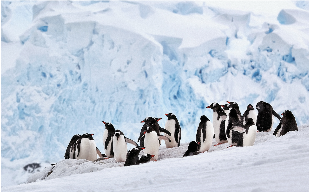
Honour Mention -1 | ND | C 4 | Neko Harbor Antarctica 28 | VOLKER MEINBERG | Germany