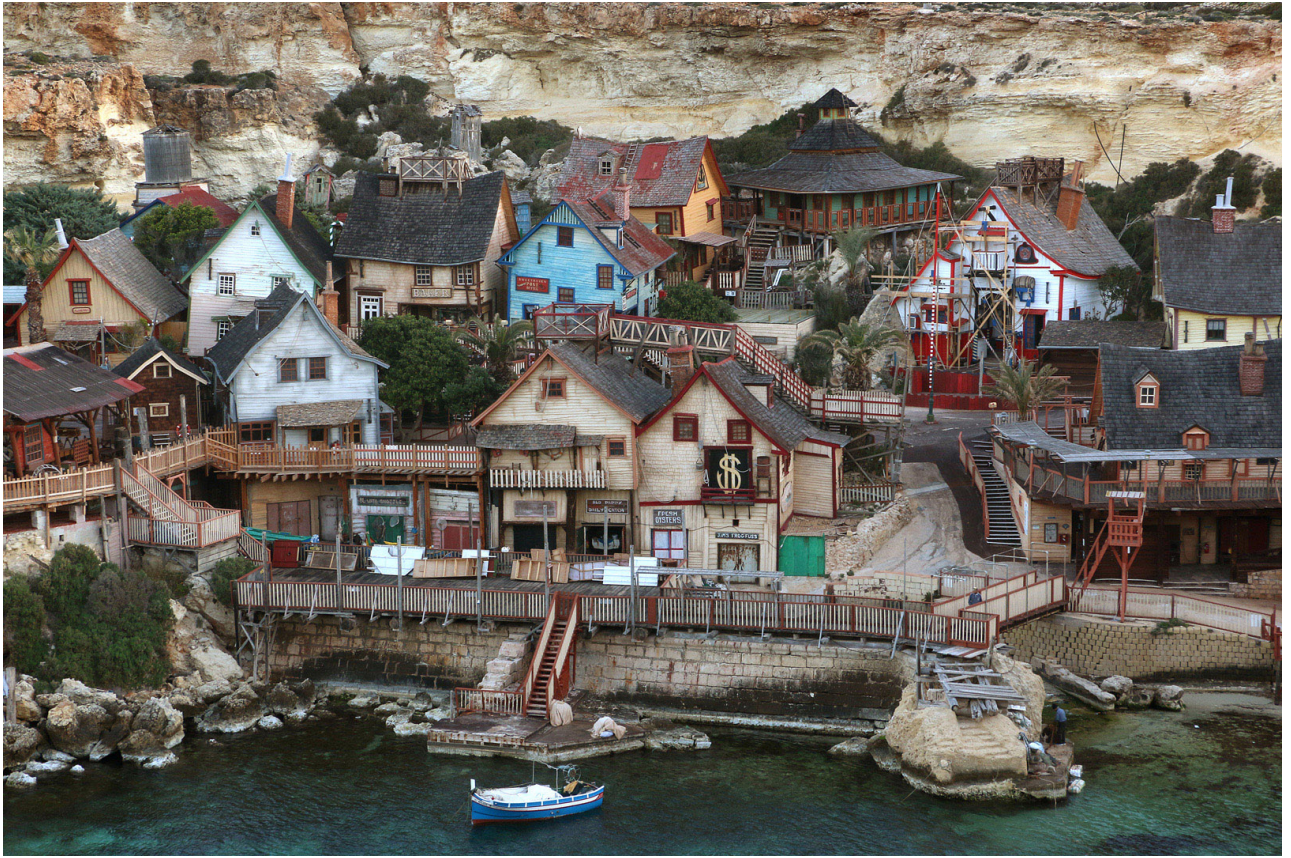
Honour Mention -3 | PTD | C 3 | Popeye Village Malta 2 | GOTTFRIED CATANIA | Malta