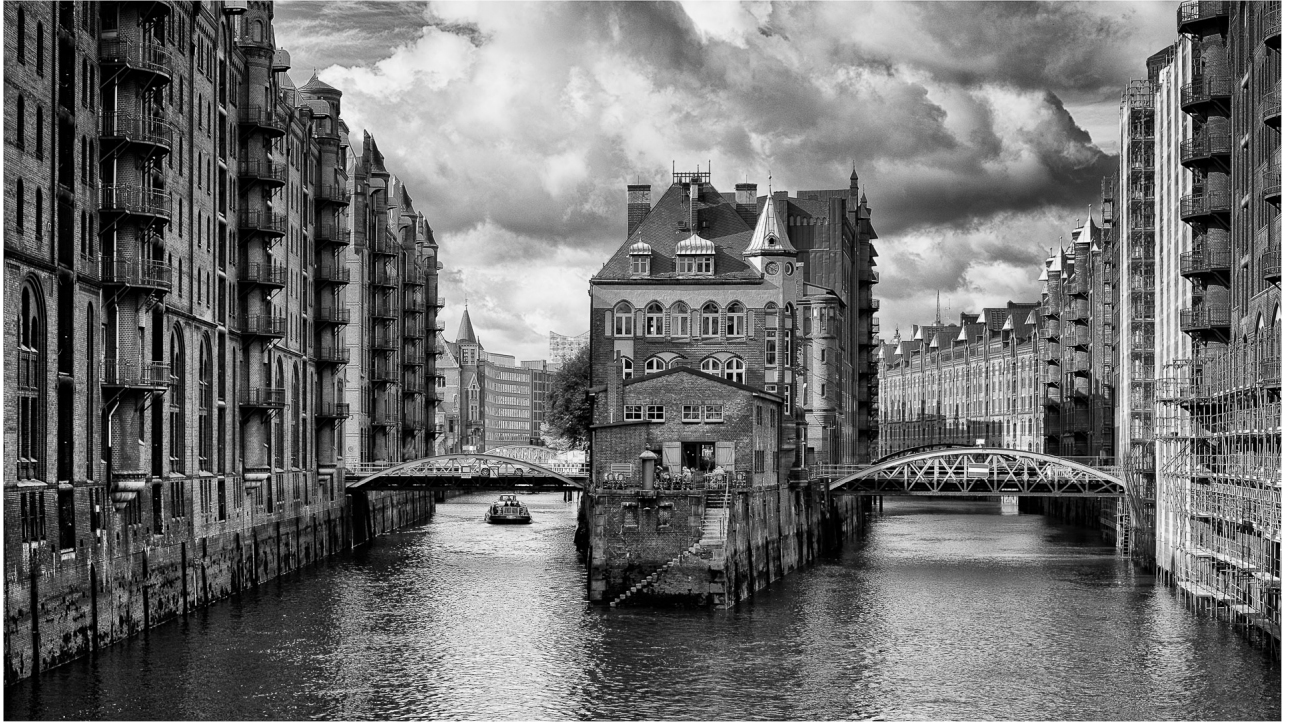
JURY CHOICE - 2 | PTD | C 3 | Wasserschloessen HH01 | BARBARA SCHMIDT | Germany