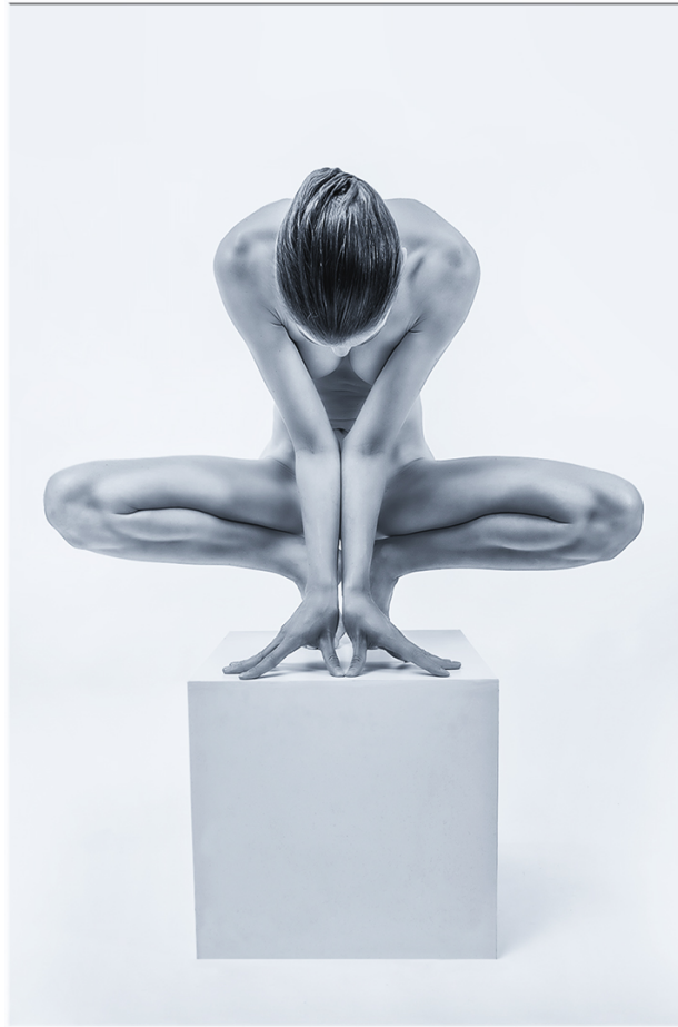
Honour Mention -2 | PIDM | C 4 | The girl on the cube | KLAUS STOCK | Switzerland