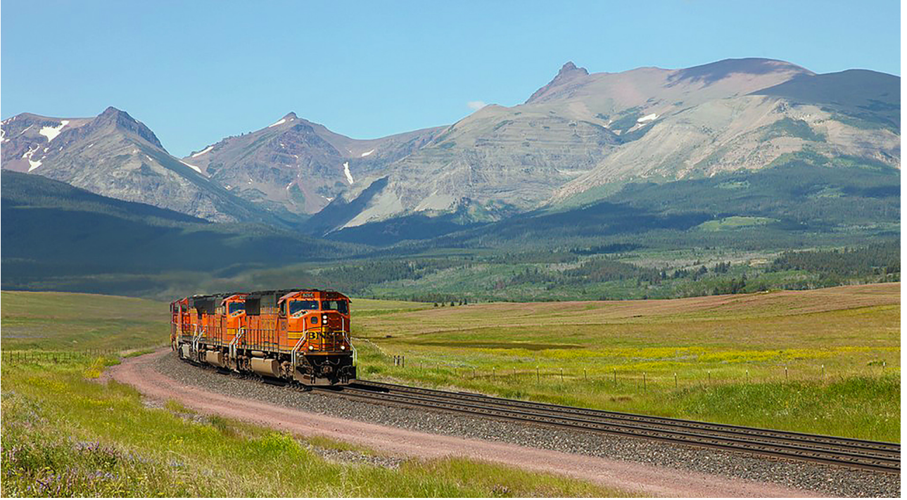
PSA GOLD | PTD | C 2 | Train To Browning | KEN MURPHY | USA