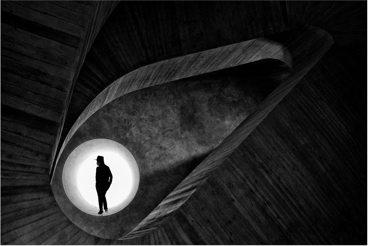
Honour Mention -3 | PIDM | C 4 | trust the path | BARBARA SCHMIDT | Germany