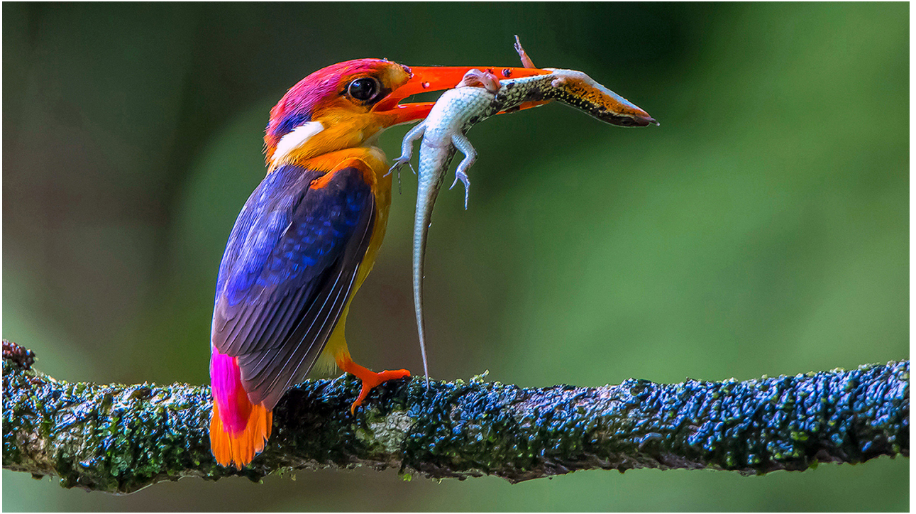
Honour Mention -2 | ND | C 4 | WESTERN BIRD WITH PREY | TUHIN KANTI DAS | India