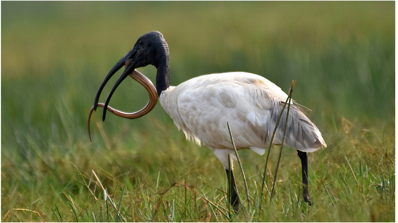
JURY CHOICE - 3 | ND | C 2 | BLACK IBIS 07 | TUHIN KANTI DAS | India