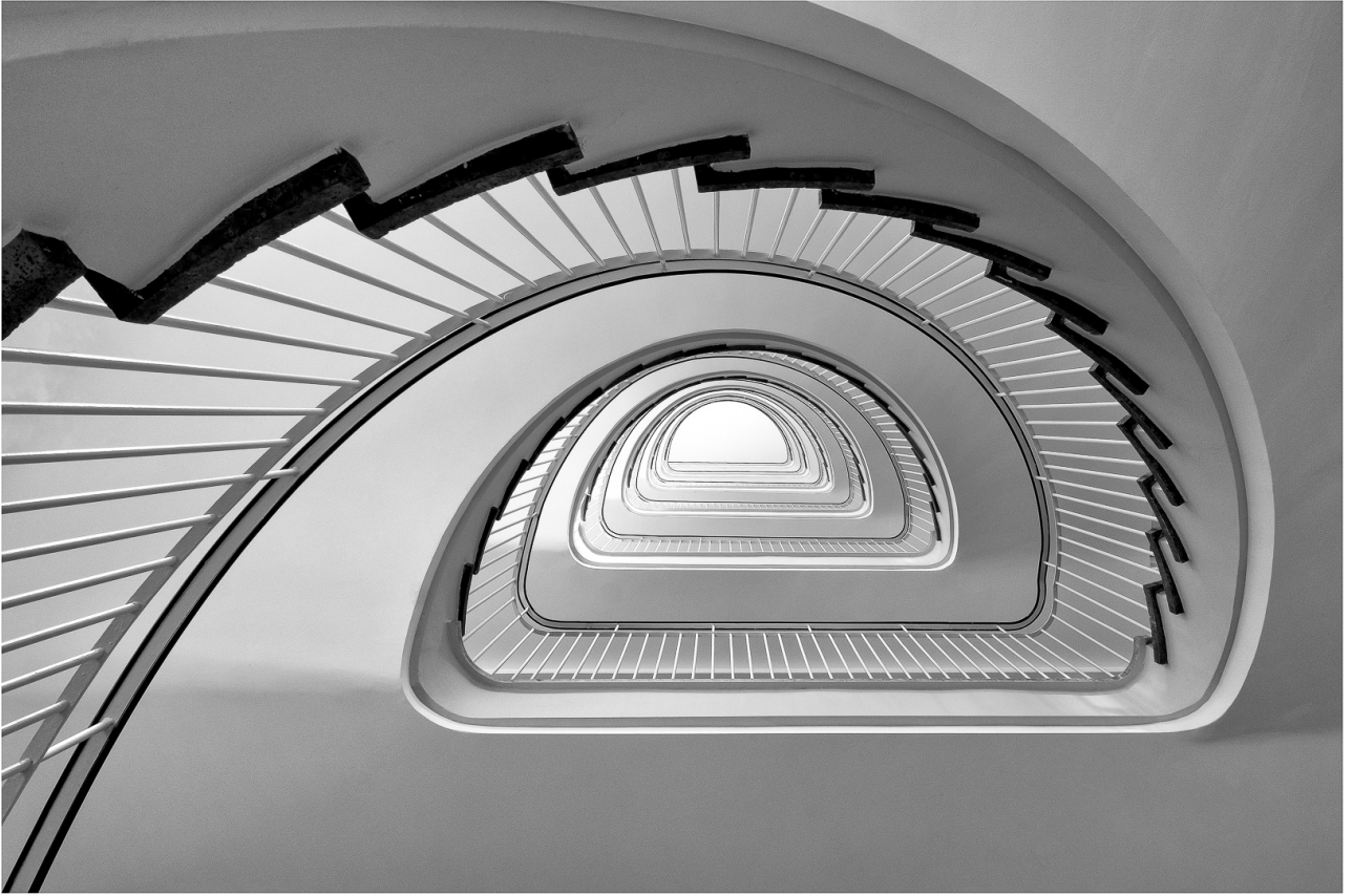
Honour Mention -2 | PIDM | C 2 | Westphalian Beauty 02 | BARBARA SCHMIDT | Germany