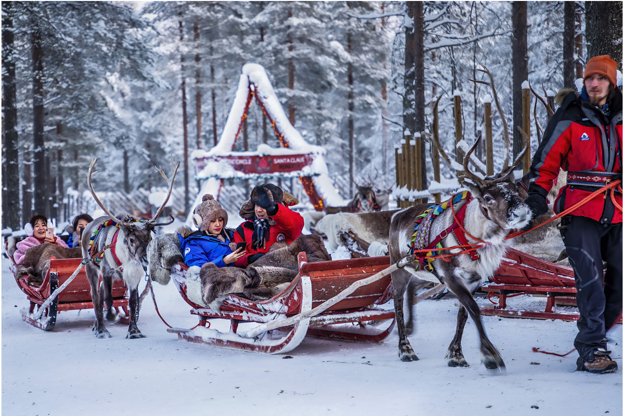
Honour Mention -3 | PTD | C 2 | Santa Claus Reindeer 2 | THAN SINT | Singapore