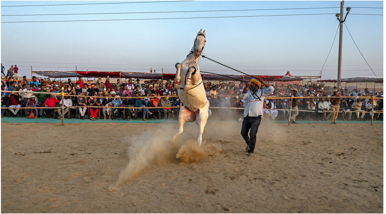
JURY CHOICE -2 | PTD | C 4 | Horse show at Maru Festival | SUBRATA BYSACK | India