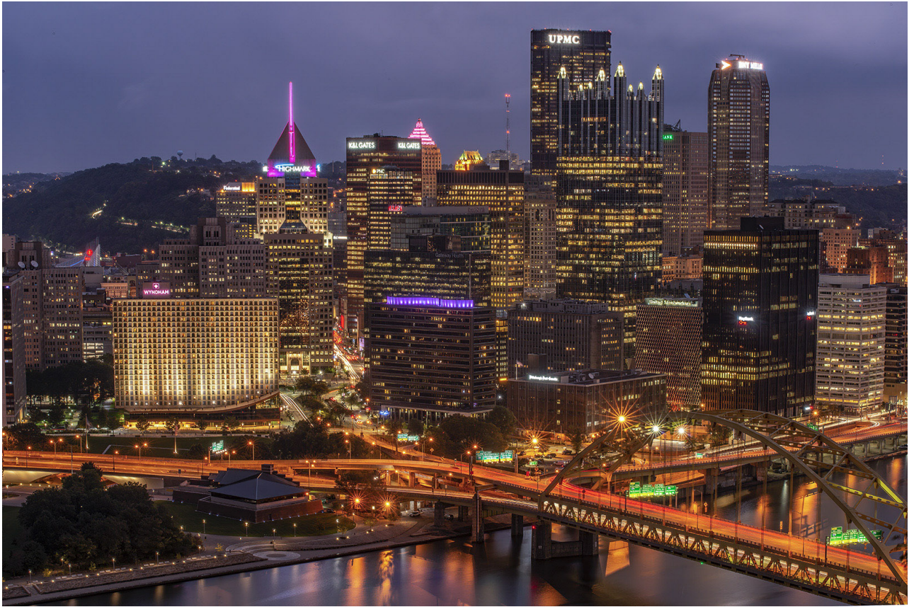
Honour Mention -3 | PTD | C 1 | Glorius Pittsburgh | JR SCHNELZER | USA