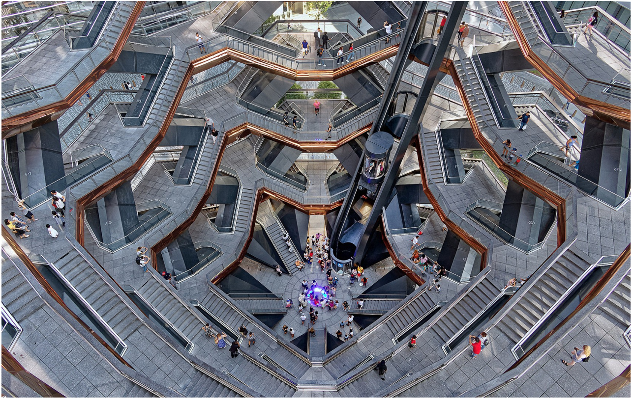
JURY CHOICE - 2 | PIDC | C 4 | NYC Vessel 04 | VOLKER MEINBERG | Germany