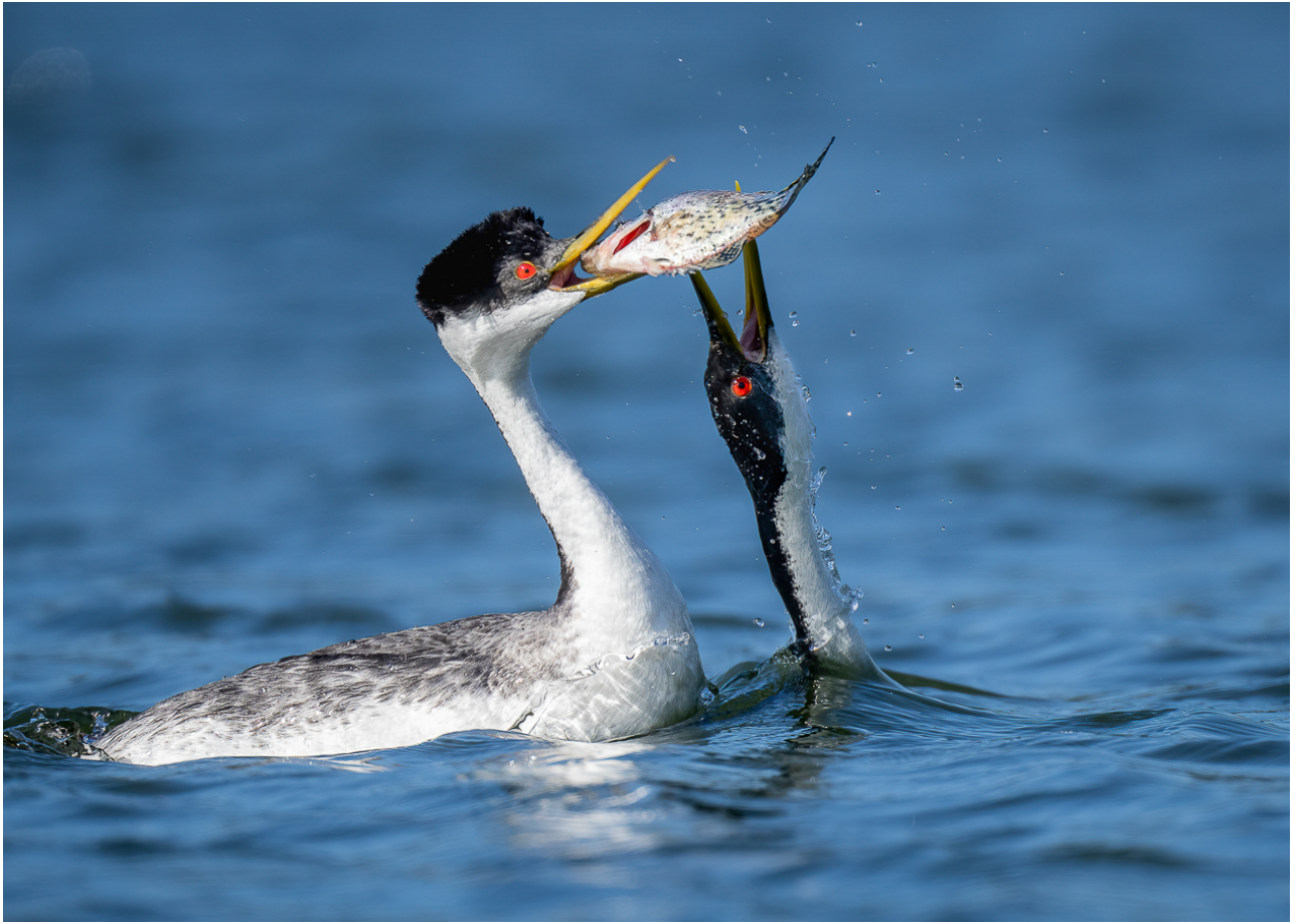
Honour Mention -2 | ND | C 2 | Fighting For Food | CHYONG YAU LIN | USA