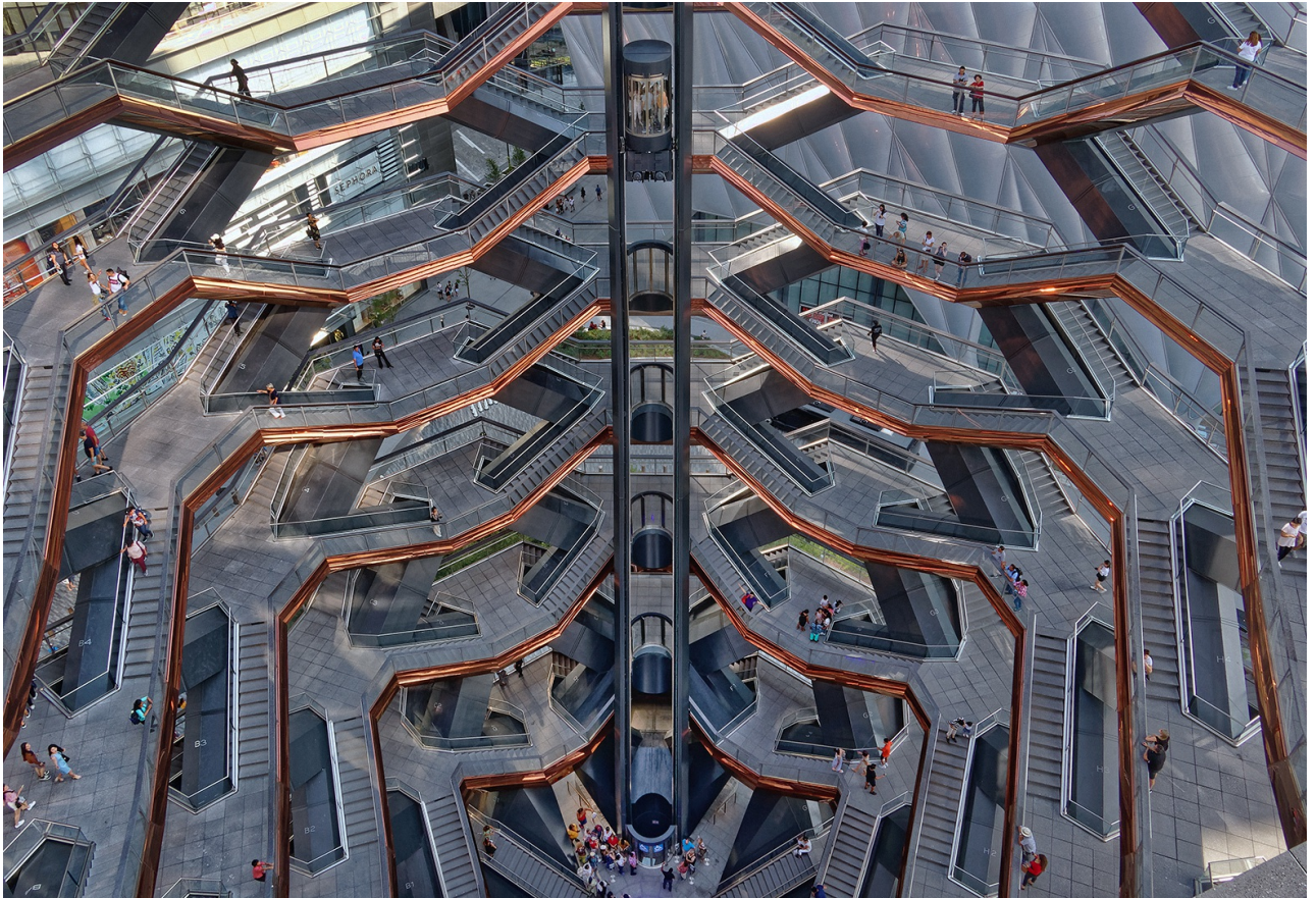
JURY CHOICE - 3 | PTD | C 1 | NYC Vessel 03 | VOLKER MEINBERG | Germany