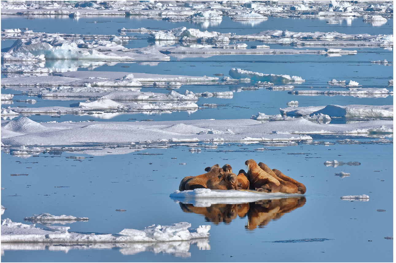
JURY CHOICE -2 | ND | C 2 | Baffin Bay Walrusses 8 | VOLKER MEINBERG | Germany