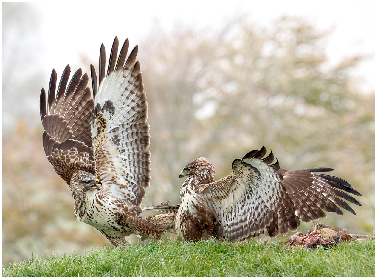
Honour Mention -3 | ND | C 3 | Buzzard Chasing Rival | GILLIAN STEYN | England