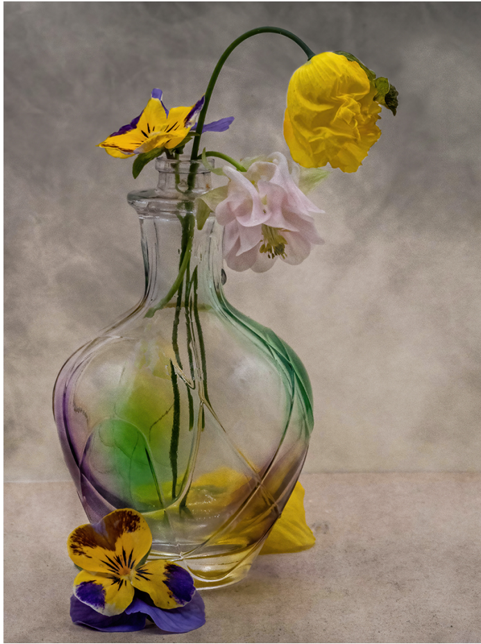
PSA GOLD | PIDC | C 1 | a vase of dreams | JENNIFER. MARGARET WEBSTER | England