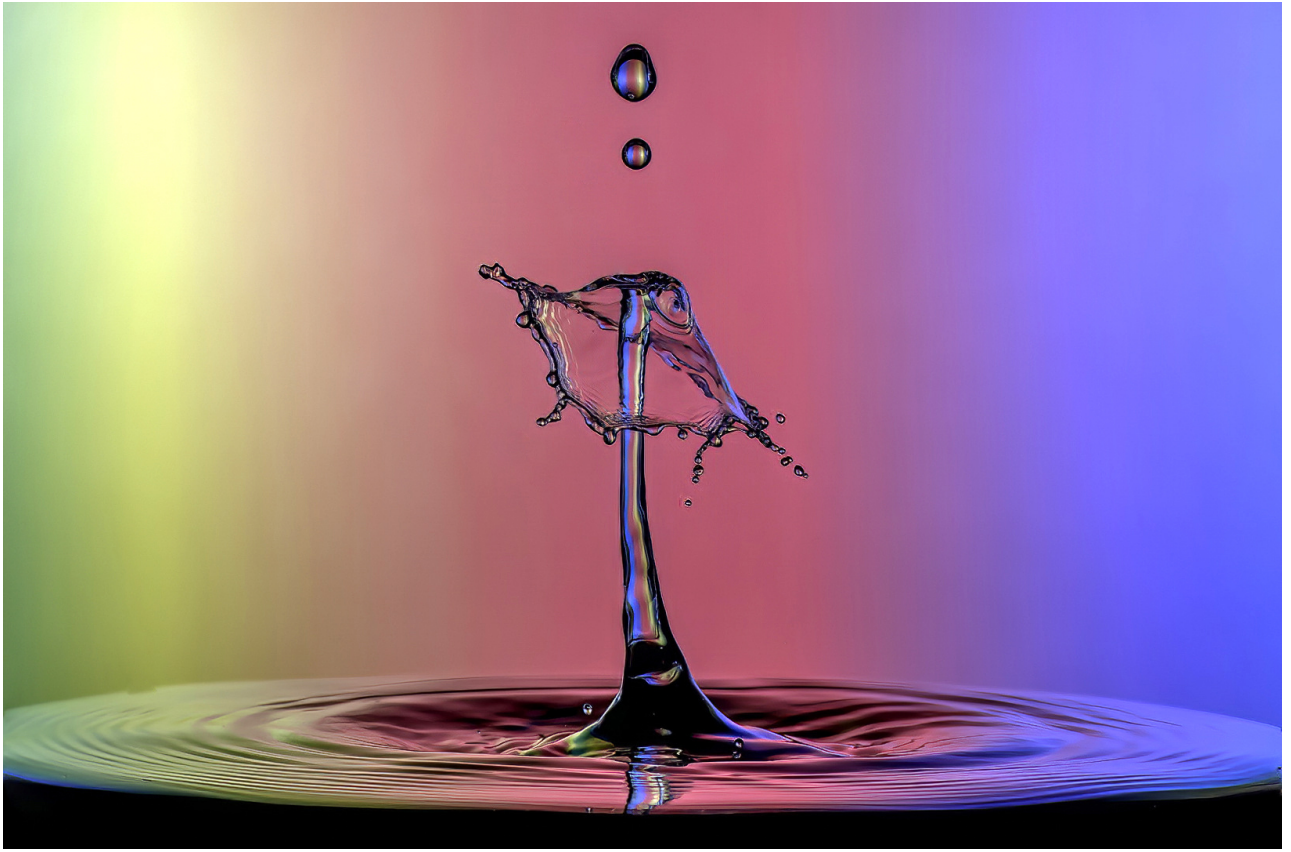
Honour Mention -1 | PIDC | C 2 | Drop on drop | LYDIA HOREMANS | Belgium