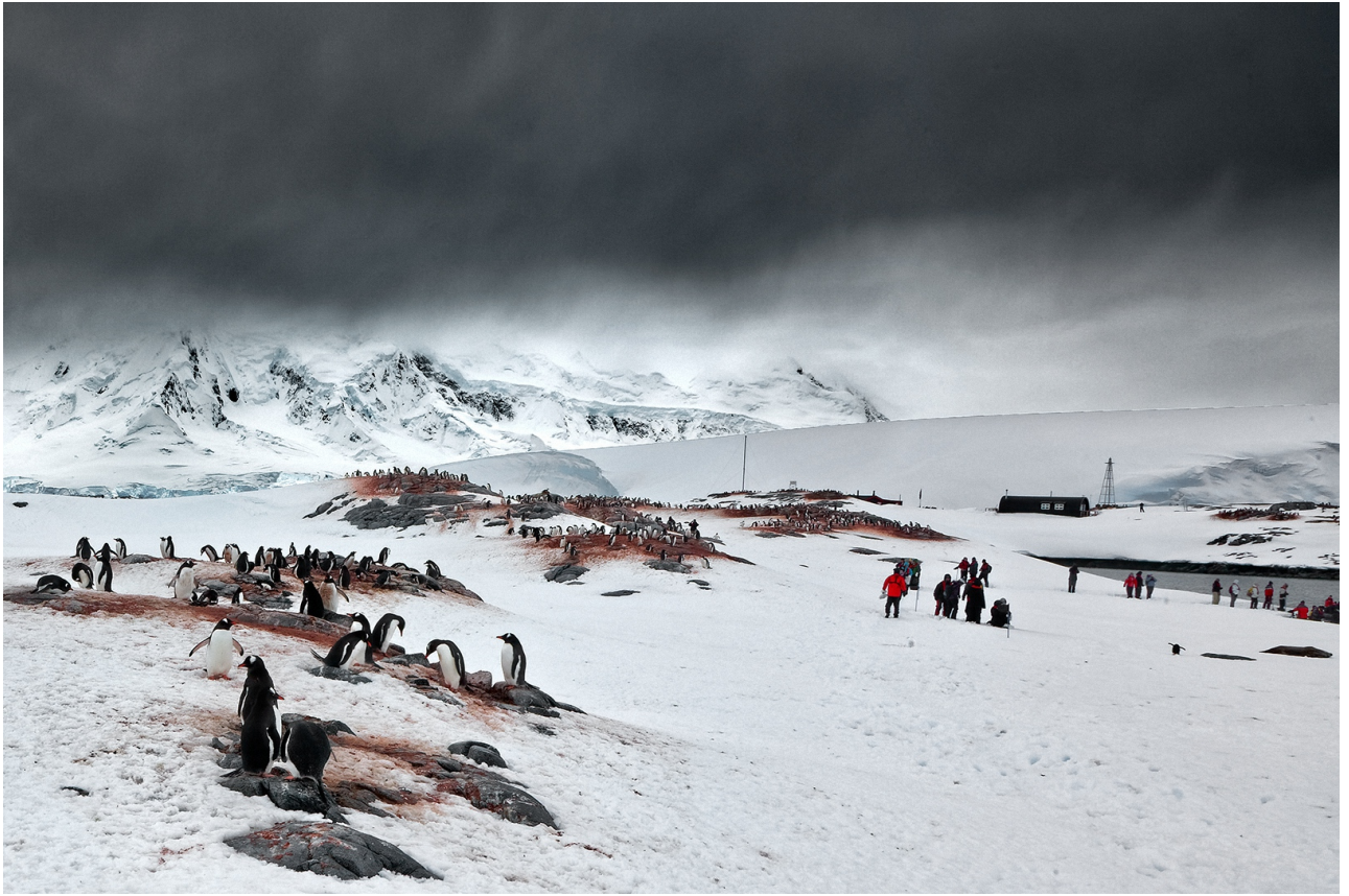
PSA GOLD | PTD | C 4 | Port Lockroy 35 | VOLKER MEINBERG | Germany