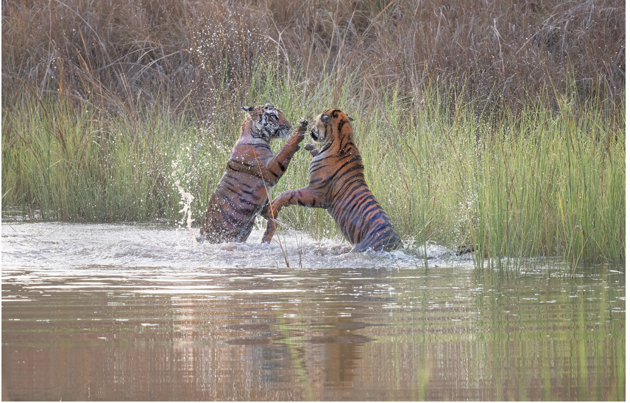
JURY CHOICE - 1 | ND | C 1 | Charge | PIYALI MITRA | India