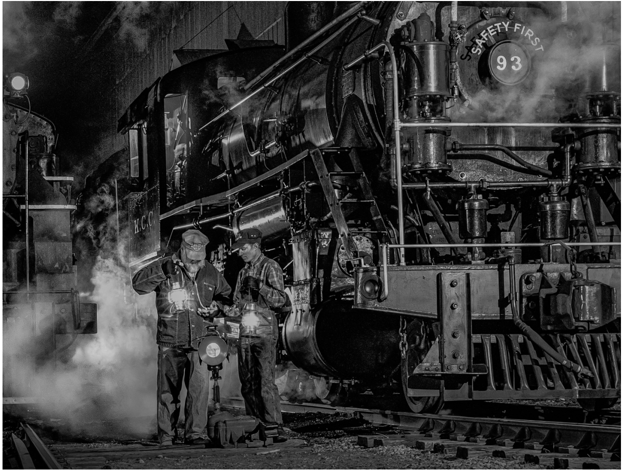
Honour Mention -3 | PIDM | C 2 | TIME_CHECK | GERALD FLEURY | USA