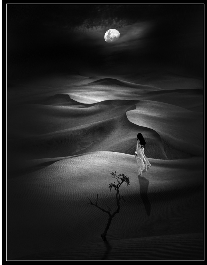
JURY CHOICE - 2 | PIDM | C 4 | Moonlit-553 | PARTHA SARATHI SARKAR | India