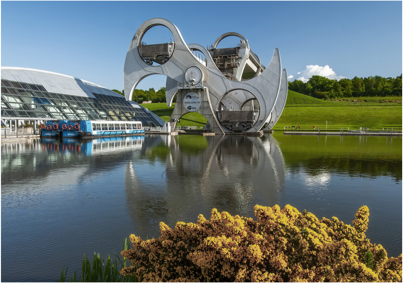
JURY CHOICE - 2 | PTD | C 1 | The Falkirk Wheel | LISA SCHNELZER | USA